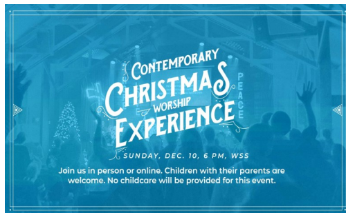
All Church Christmas Worship Experience 12/10/23 6pm West Side South