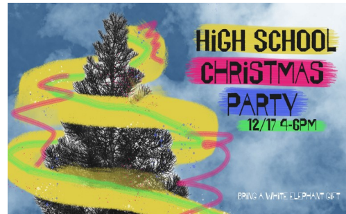
HS Christmas Party 12/17/23 4-6pm Bring a white elephant gift to exchange