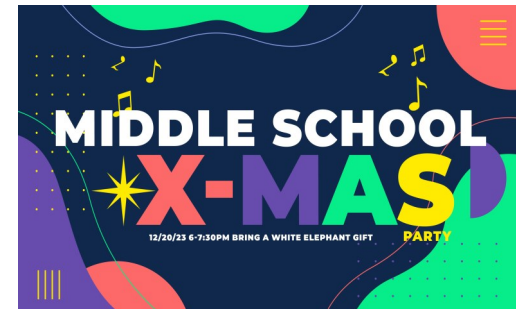
MS Christmas Party 12/20/23 6-7:30pm Bring a white elephant gift to exchange